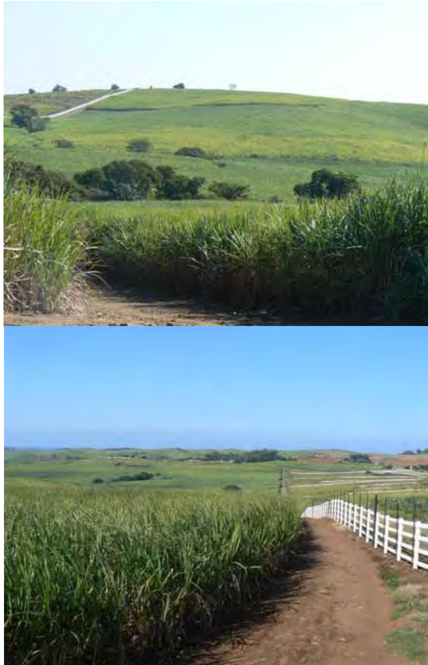
Views of site showing boundaries with Seaton Delaval and sugar cane with some alien and indigenous vegetation in the drainage channels.