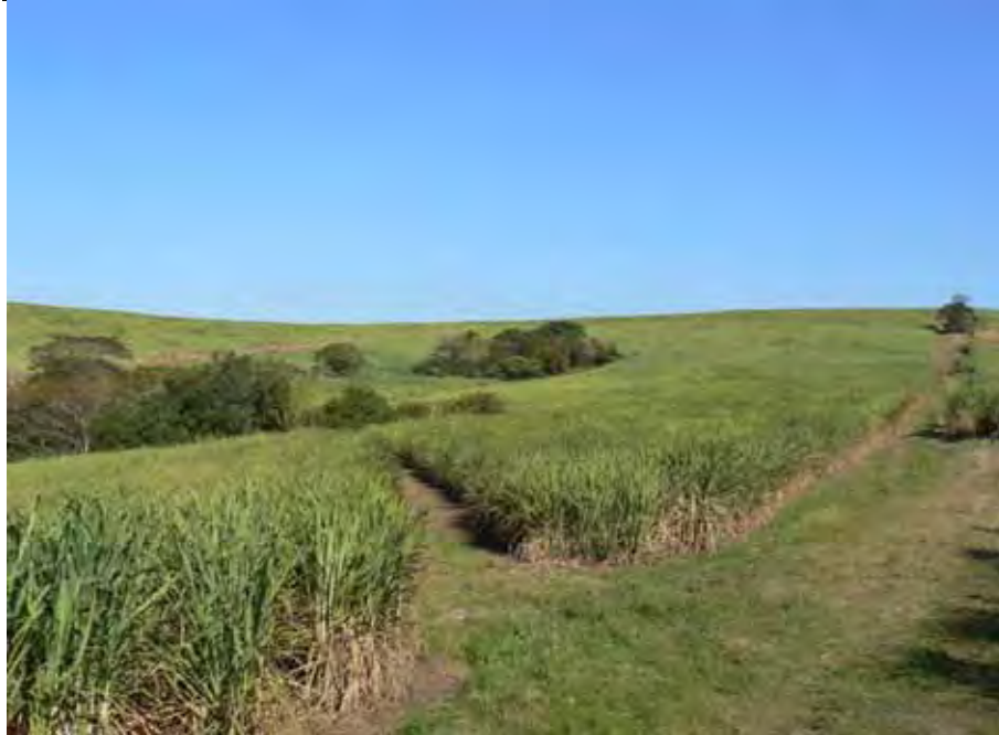
Top: View of dam on the property