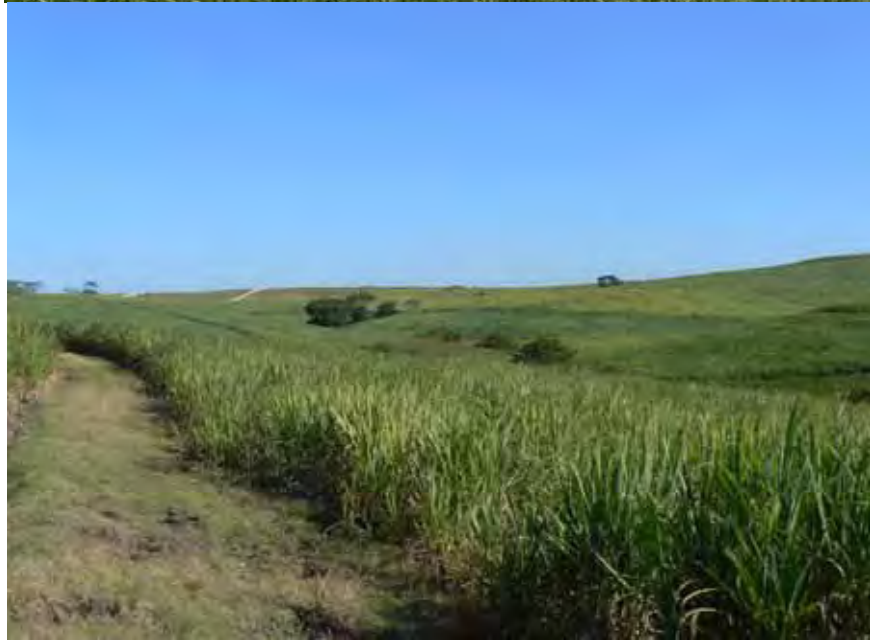
Views across the site looking east towards the coast